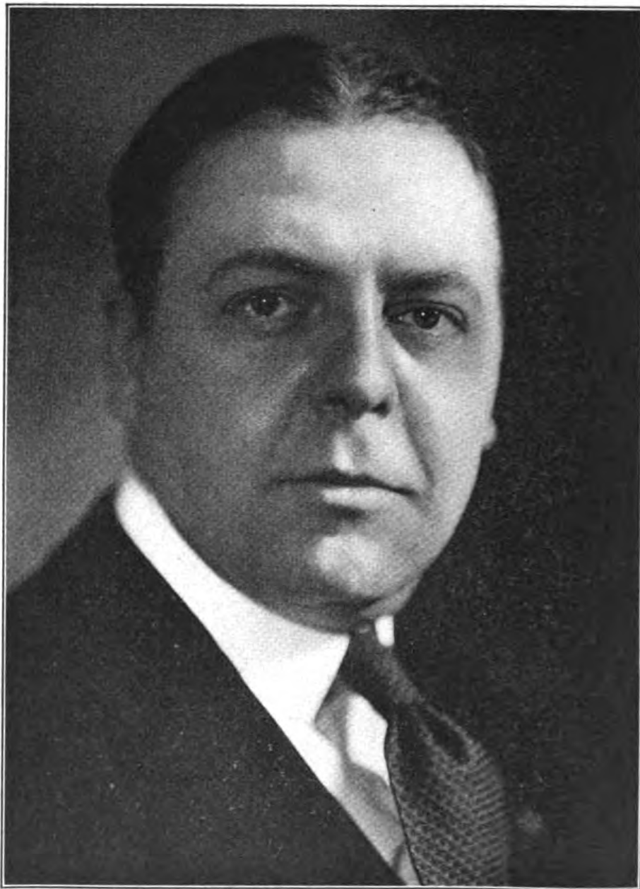
HON. WILBER M. BRUCKER Governor of Michigan